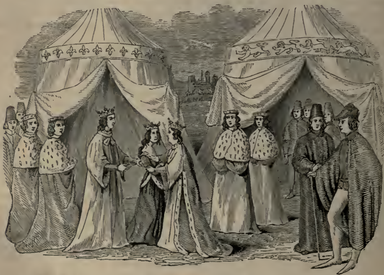
ISABELLA AND THE KING OF ENGLAND TAKING LEAVE OF THE KING OF FRANCE, AT THE CAMP BETWEEN ARDRES AND CALAIS. FROM MSS. OF THE 15TH CENTURY.

At eleven o'clock of the Saturday morning, the feast of Saint Simon and Saint Jude, the king of England, attended by his uncles and all the noblemen who had accompanied him from England, waited on the king of France in his tent. They were received by the king, his brother, and uncles, with great pomp and the most affectionate words. The dinner-tables were there laid out: that for the kings was long and handsome, and the side-board covered with the most magnificent plate. The two kings were seated by themselves; the king of France at the top of the table, and the king of England below him, but at a good distance from each other. They were served by the dukes of Berry, Burgundy, and Bourbon: the last entertained the two monarchs with many gay remarks, to make them laugh, and those about the table, for he had much drollery, and, addressing the king of England, said,—“My lord king of England, you ought to make good cheer, for you have had all your wishes gratified. You have a wife, or shall have one, for she will be speedily delivered to you.” “Bourbonnois,” replied the king of France, “we wish our daughter were as old as our cousin of Saint Pol, though we were to double her